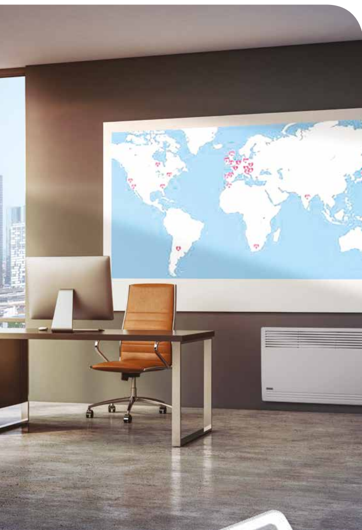
Model S2026-27 1000 or 2000 watts

Reduces the wattage 50% by touching the 'eco' button, reducing the power consumption on those 'not so cold' days or when just a warm background heat is needed.