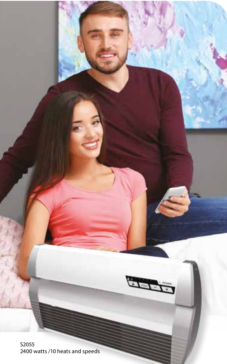
S2055 2400 watts /10 heats and speeds

We have created 'Optima' a new and better fan forced surface mount 'Electronic' Space Heater with Tangential Fan to deliver greater heat output with significantly less noise than other wall mounted fan heaters.