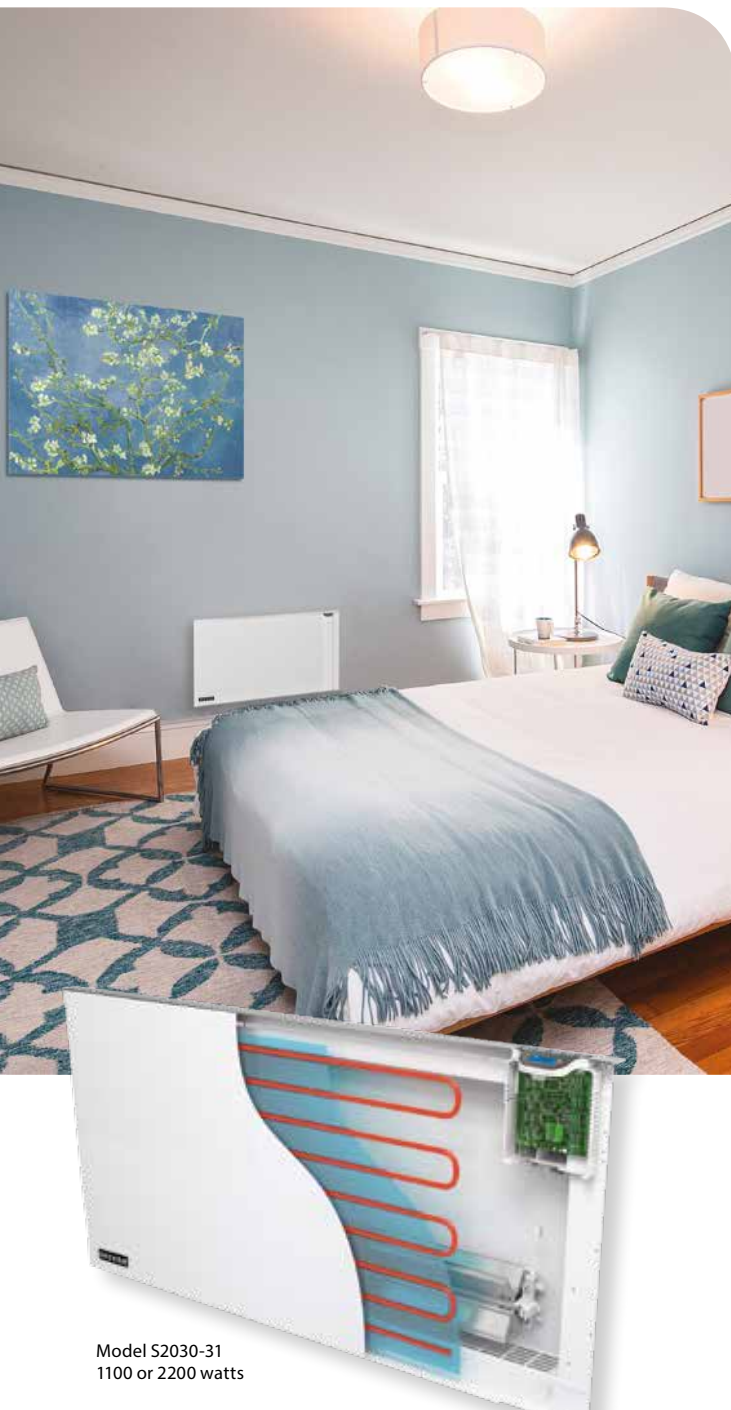
Model S2030-31 1100 or 2200 watts

'Clima, a discreet elegant and sleek design featuring 'Zetto' Silent Element System. Select gentle, diffused heating that makes every room feel warm and cosy. 'Clima' delivers your desired temperature with spot-on precision and also saves on energy consumption.