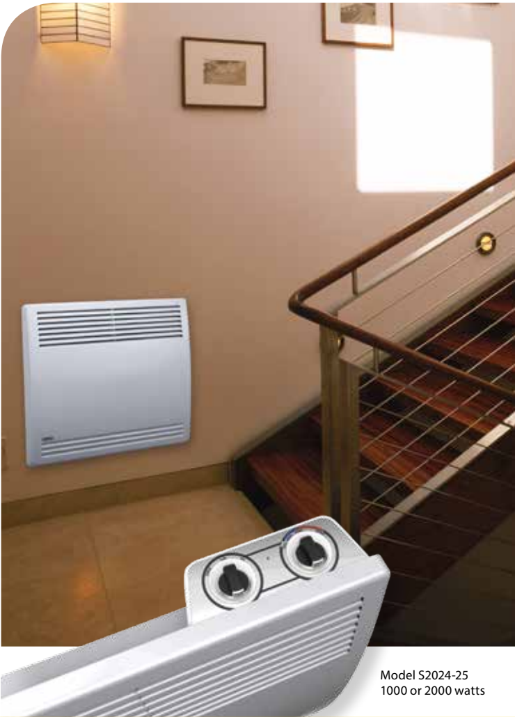
Model S2024-25 1000 or 2000 watts

We are forever looking to improve Serene products and have made important yet subtle design improvements for 2018 that enhance both performance and outlook.